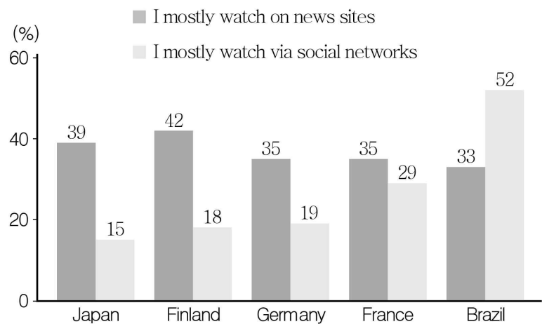
News Video Consumption: on News Sites vs. via Social Networks

The above graph shows how people in five countries consume news videos: on news sites versus via social networks. ① Consuming news videos on news sites is more popular than via social networks in four countries. ② As for people who mostly watch news videos on news sites, Finland shows the highest percentage among the five countries. ③ The percentage of people who mostly watch news videos on news sites in France is higher than that in Germany. ④ As for people who mostly watch news videos via social networks, Japan shows the lowest percentage among the five countries. ⑤ Brazil shows the highest percentage of people who mostly watch news videos via social networks among the five countries.